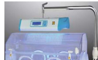
Phototherapy unit(option) MitirBBP-3000B