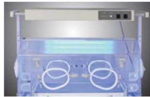
Tube phototherapy unit(option)