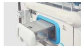
Removable for cleaning