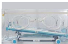
Free-step mattress tilting adjust