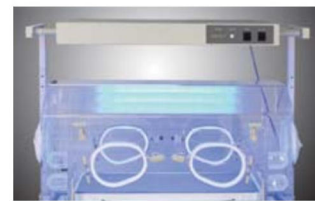
Tube phototherapy unit(option)