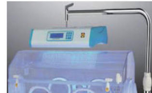
LED Phototherapy unit(option)