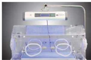
LED phototherapy unit(option)