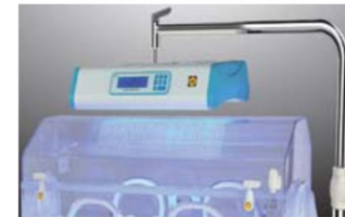
LED Phototherapy unit(option)