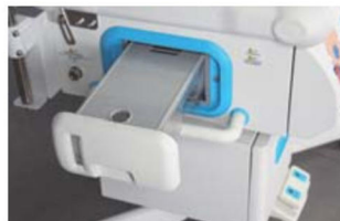
Removable for cleaning