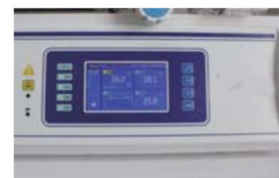
LCD coloured controller