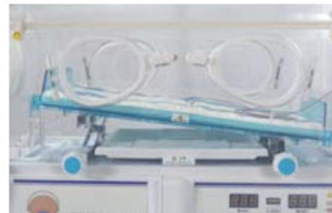
Free-step mattress tilting adjust