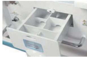
The humidity reservoir is removable