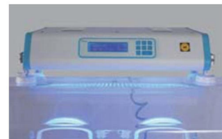
Phototherapy unit(option) MitirBBP-1000B/2000B