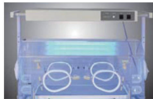
Tube phototherapy unit(option)