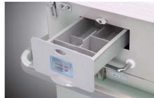
The humidity reservoir is removable