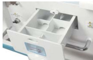
The humidity reservoir is removable