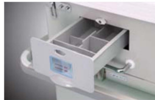
The humidity reservoir is removable