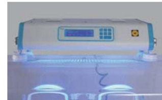
Phototherapy unit(option) MitirBBP-1000B/2000B