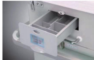
The humidity reservoir is removable