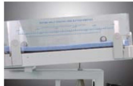
Free-step mattress tilting adjust