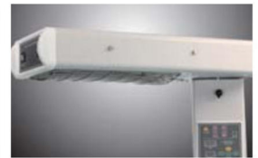
Radiation head that can be adjusted in horizontal angulation